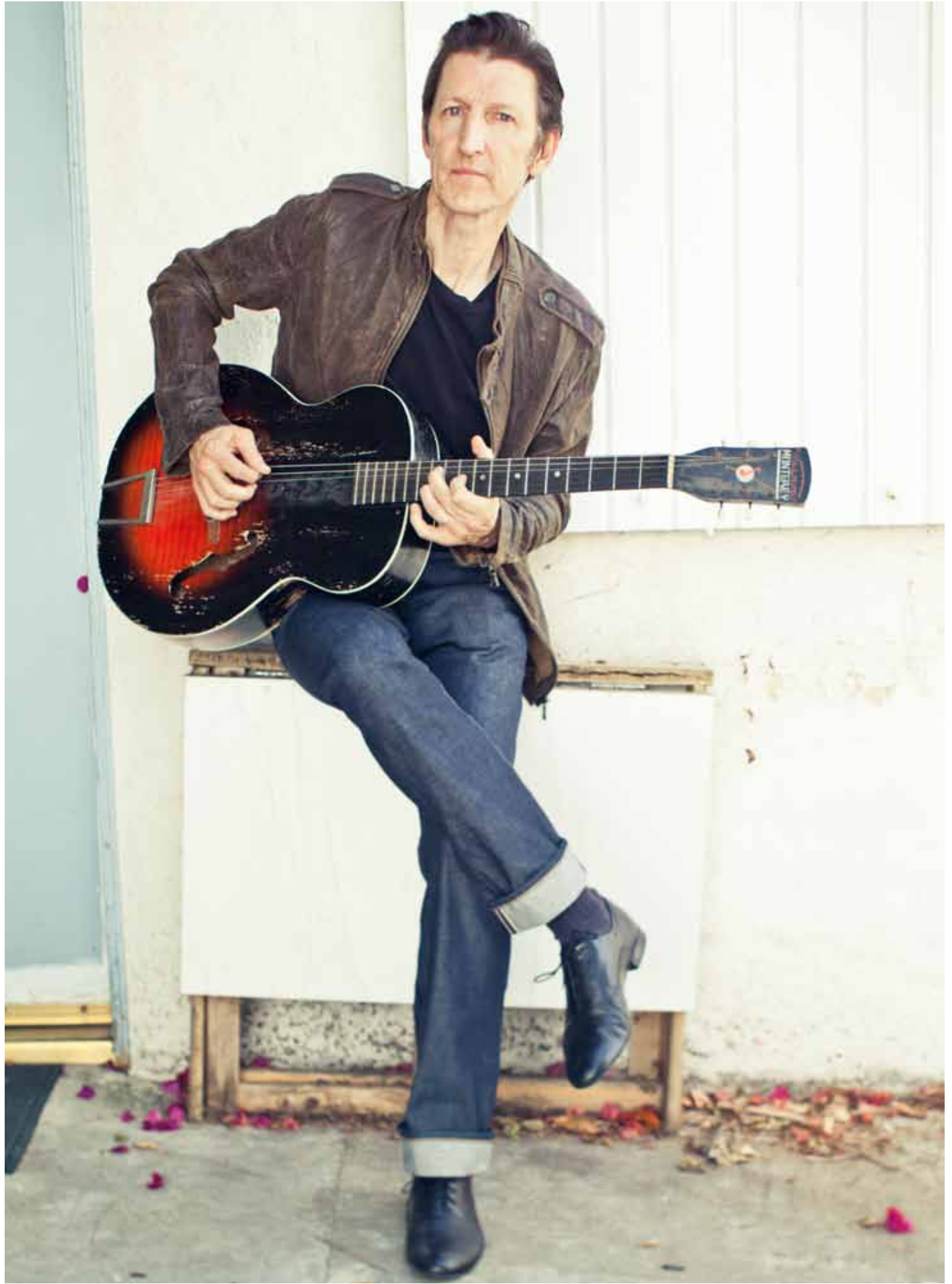
NORWOOD LEATHER JACKET, DANIEL CREW TEE & NSF DENIM RAW