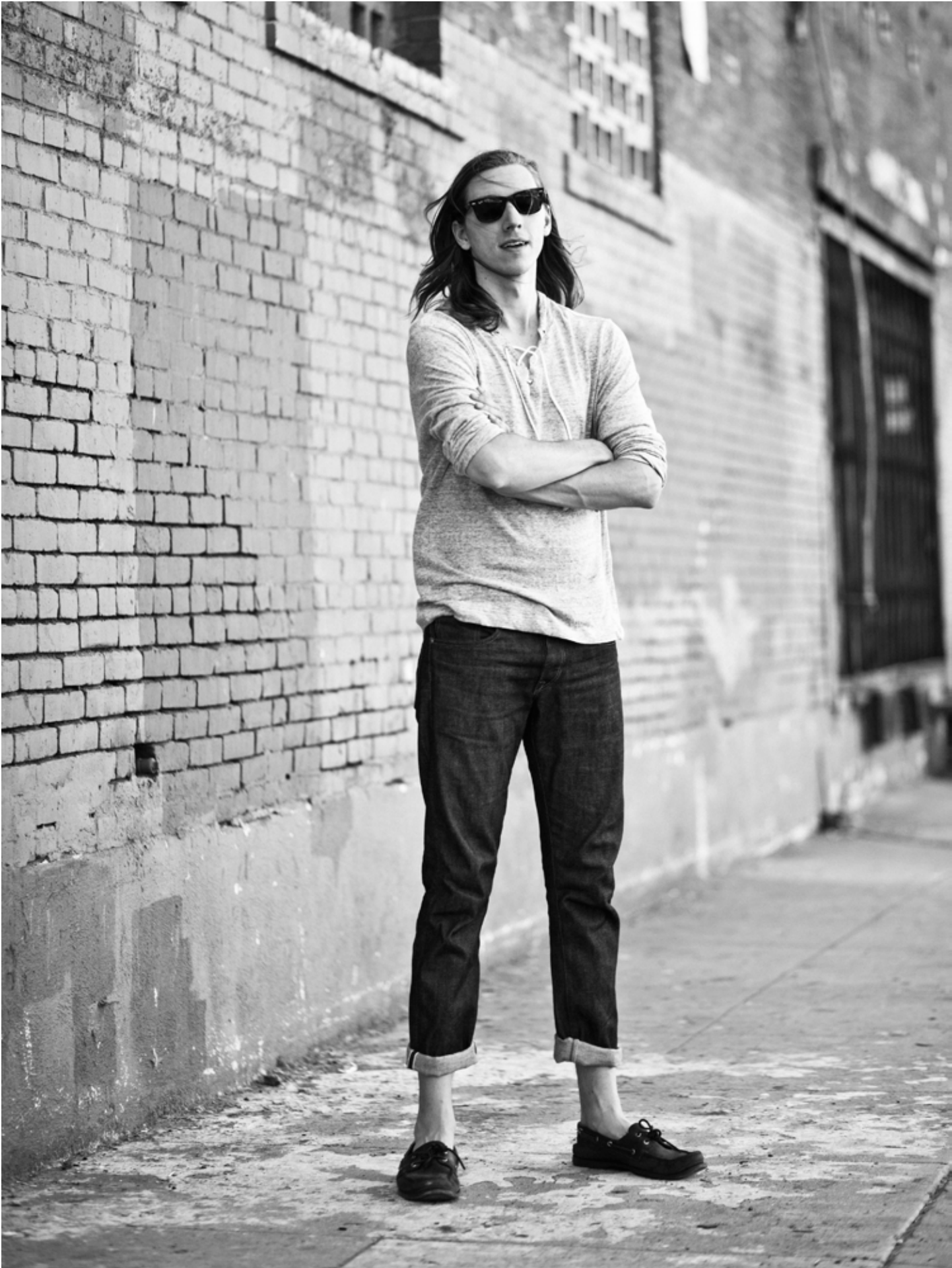
KNOX KNIT PULLOVER & NSF DENIM RAW