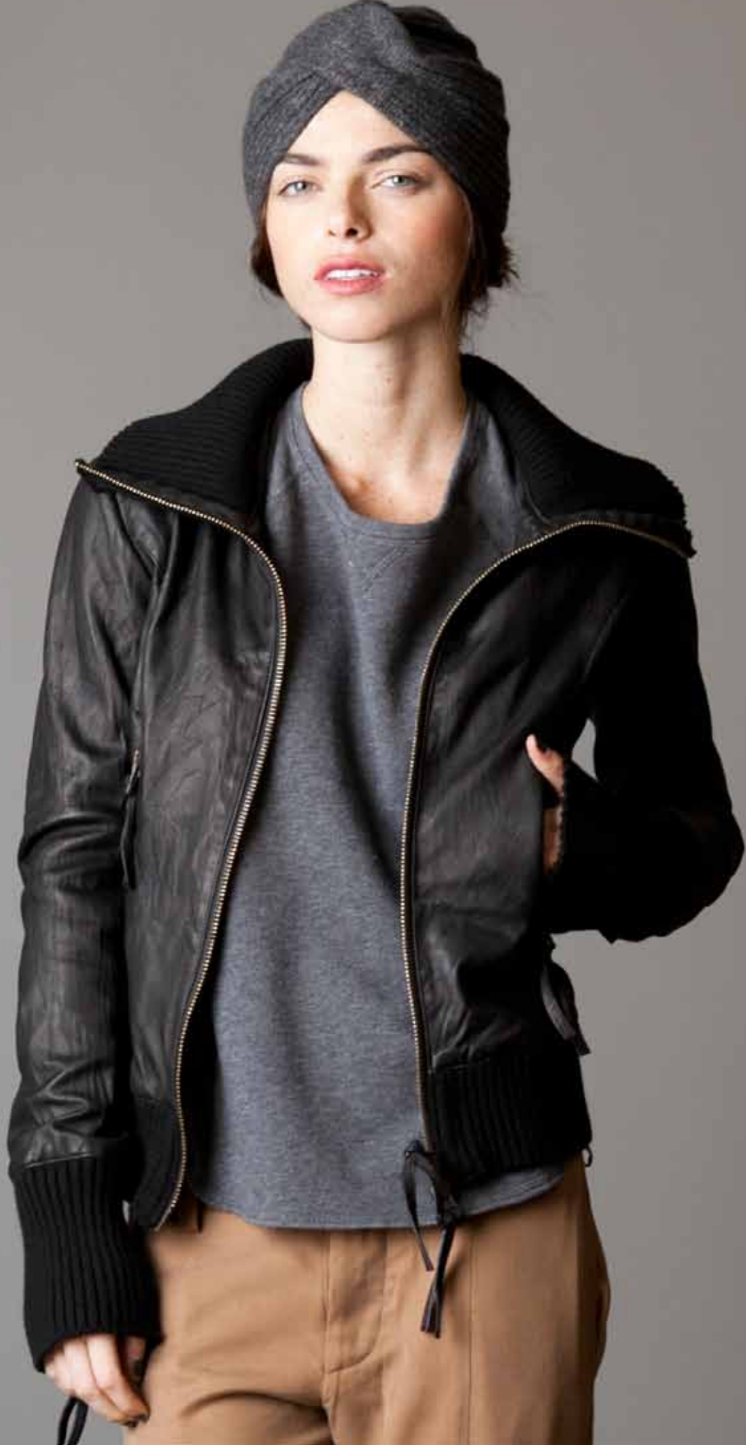
DEVIN WASHED LEATHER JACKET BLACK 3063 + HAINES STRETCH TERRY DOLMAN CHARCOAL 2409 + MAXON SOFT CARGO CAMEL 9065