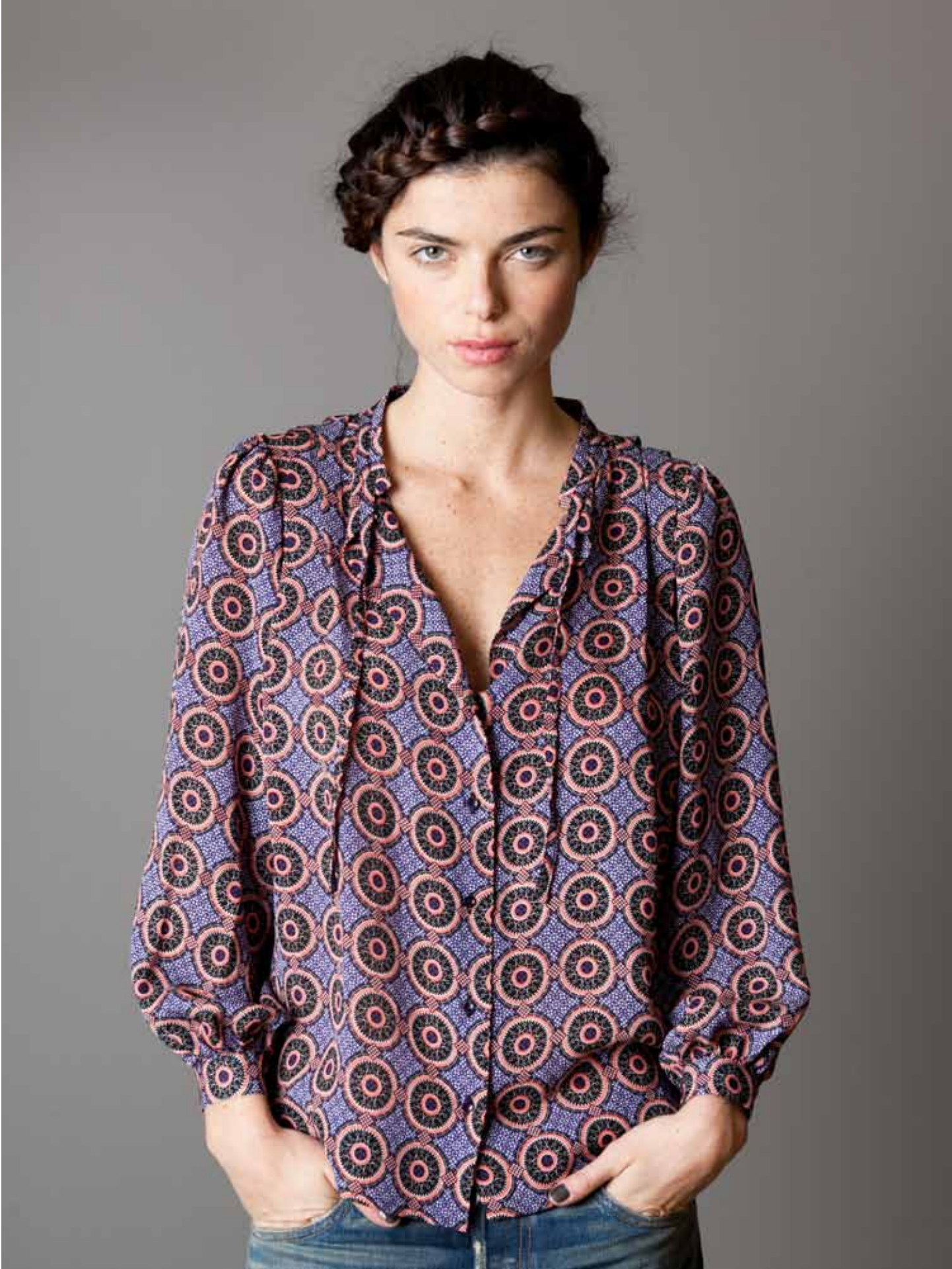
SOPHIA SILK TILE PRINT BLOUSE 1059 + NSF DENIM 9043-HUS "HUSTON"