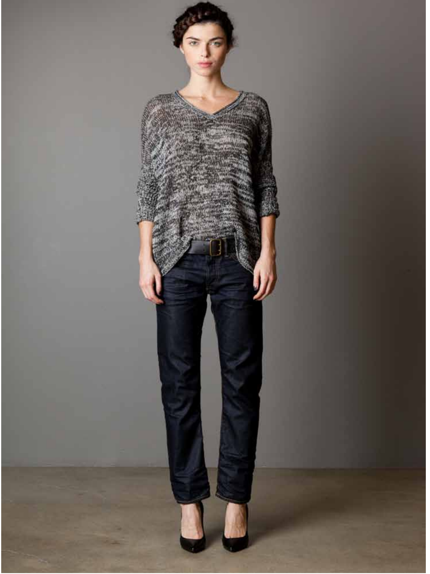
FAYE LOOSE STITCH WOOL CASHMERE SWEATER IN BLACK MELANGE 2425 + NSF DENIM 9043-JAC "JACKSON"