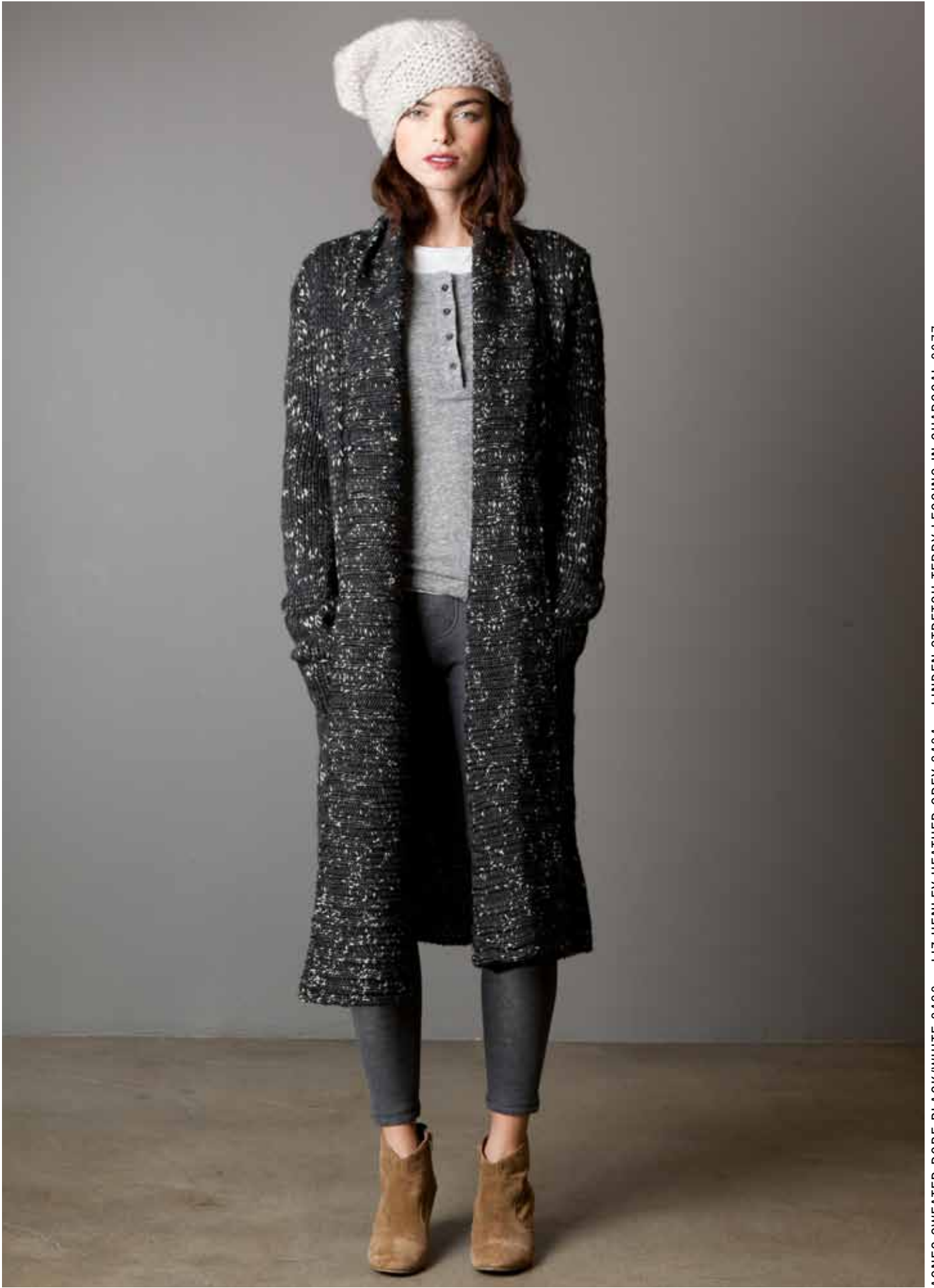
AGNES SWEATER ROBE BLACK/WHITE 2423 + LIZ HENLEY HEATHER GREY 2434 + LINDEN STRETCH TERRY LEGGING IN CHARCOAL 9077