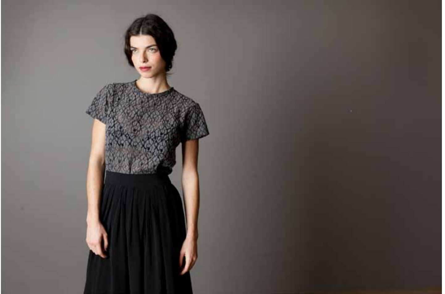
ANNETTE LACE TEE GREY 1057 + MADELEINE SILK SKIRT BLACK 1040

Founded in 2005 by Nick Friedberg, NSF has earned a loyal following for its clean aesthetic, understated cool and eminently wearable collections. Blending contemporary attitude with the understated softness of its menswear roots, the brand continues to expand and evolve. Women seek NSF for its quiet ease, confident attitude and attention to detail.