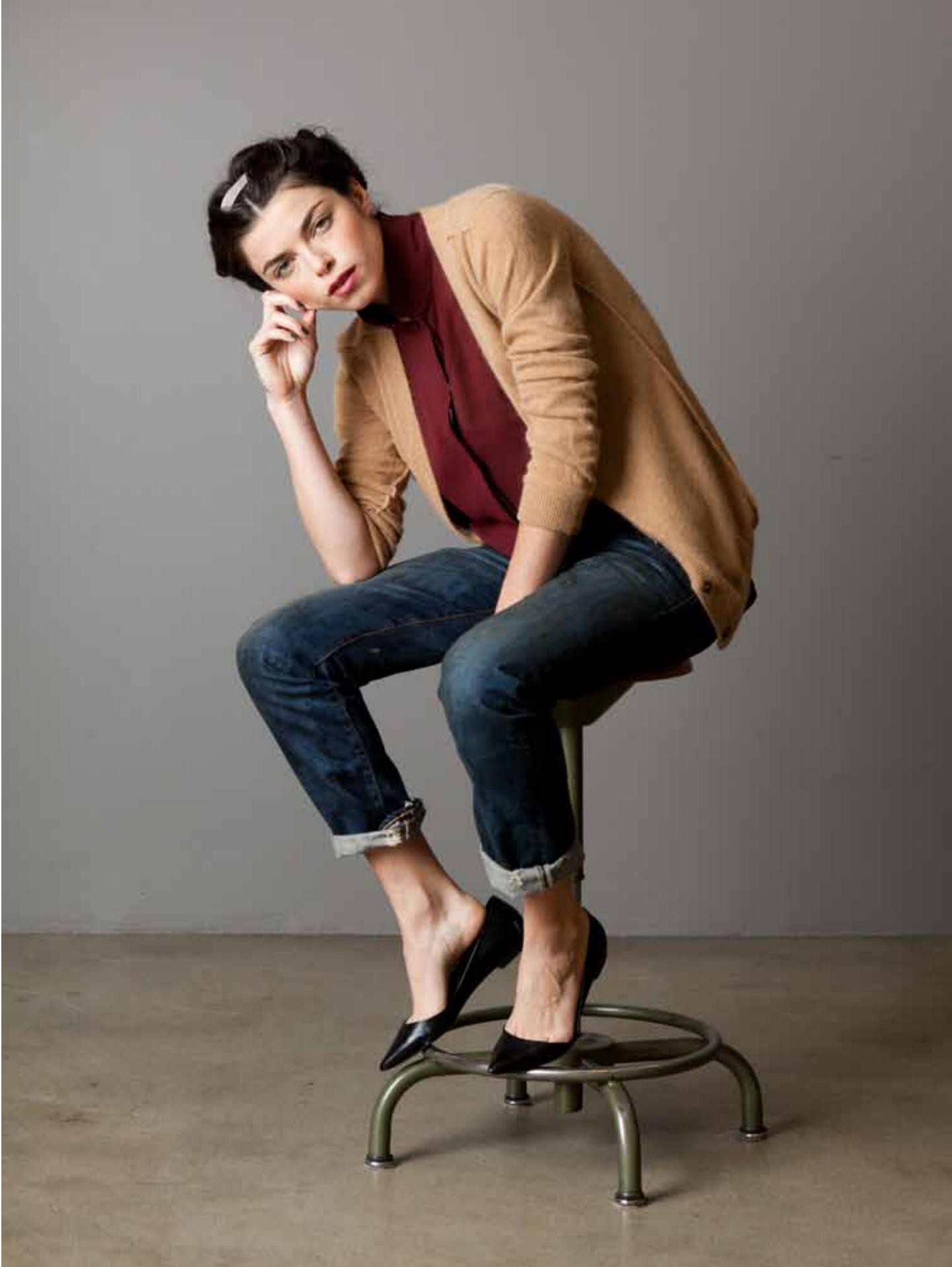
HALLE SLEEVELES SILK BLOUSE MULBERRY 2384 + MORGAN CARDIGAN CAMEL 2413 + NSF DENIM 9043-DKH "DARK HARLAN"