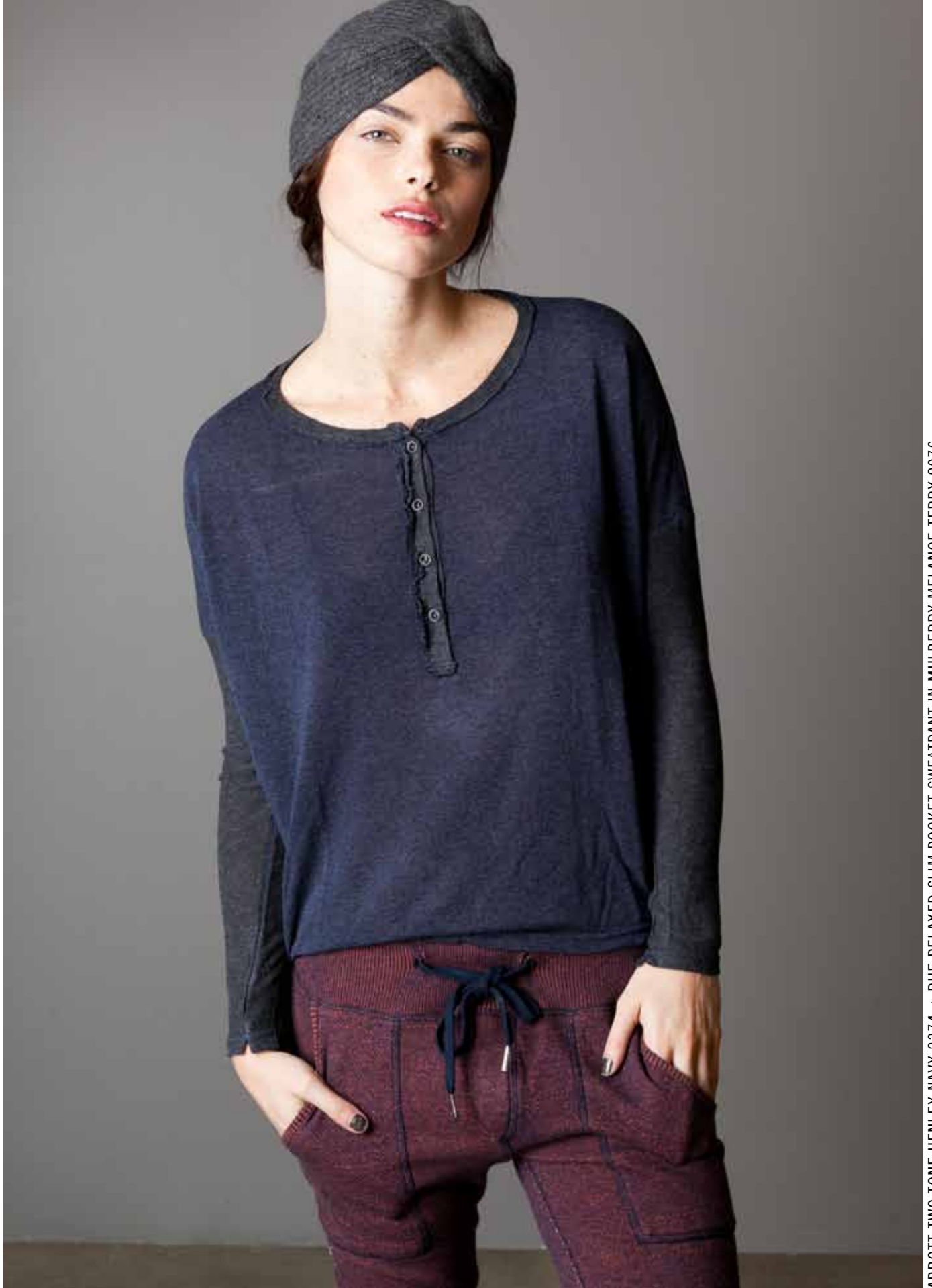
ABBOTT TWO TONE HENLEY NAVY 2374 + RUE RELAXED SLIM POCKET SWEATPANT IN MULBERRY MELANGE TERRY 9076