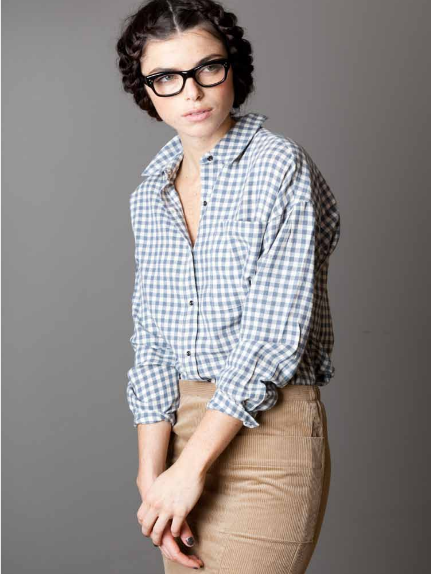
QUINTIN CHEQUE BUTTON DOWN GREY 2325FA + HARLEY SLIM SKIRT CAMEL 9069