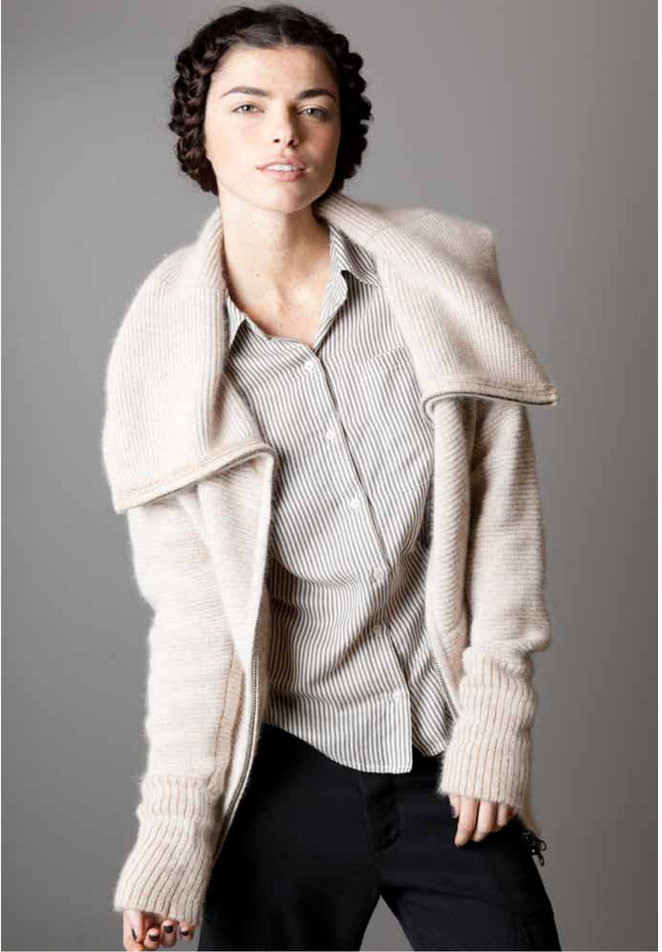
GABBY SWEATER COAT LIGHT CAMEL 2392 + KEMP MINISTRIPED BUTTON DOWN GREY 2325-STRIPE + MAXON SOFT CARGO BLACK 9065