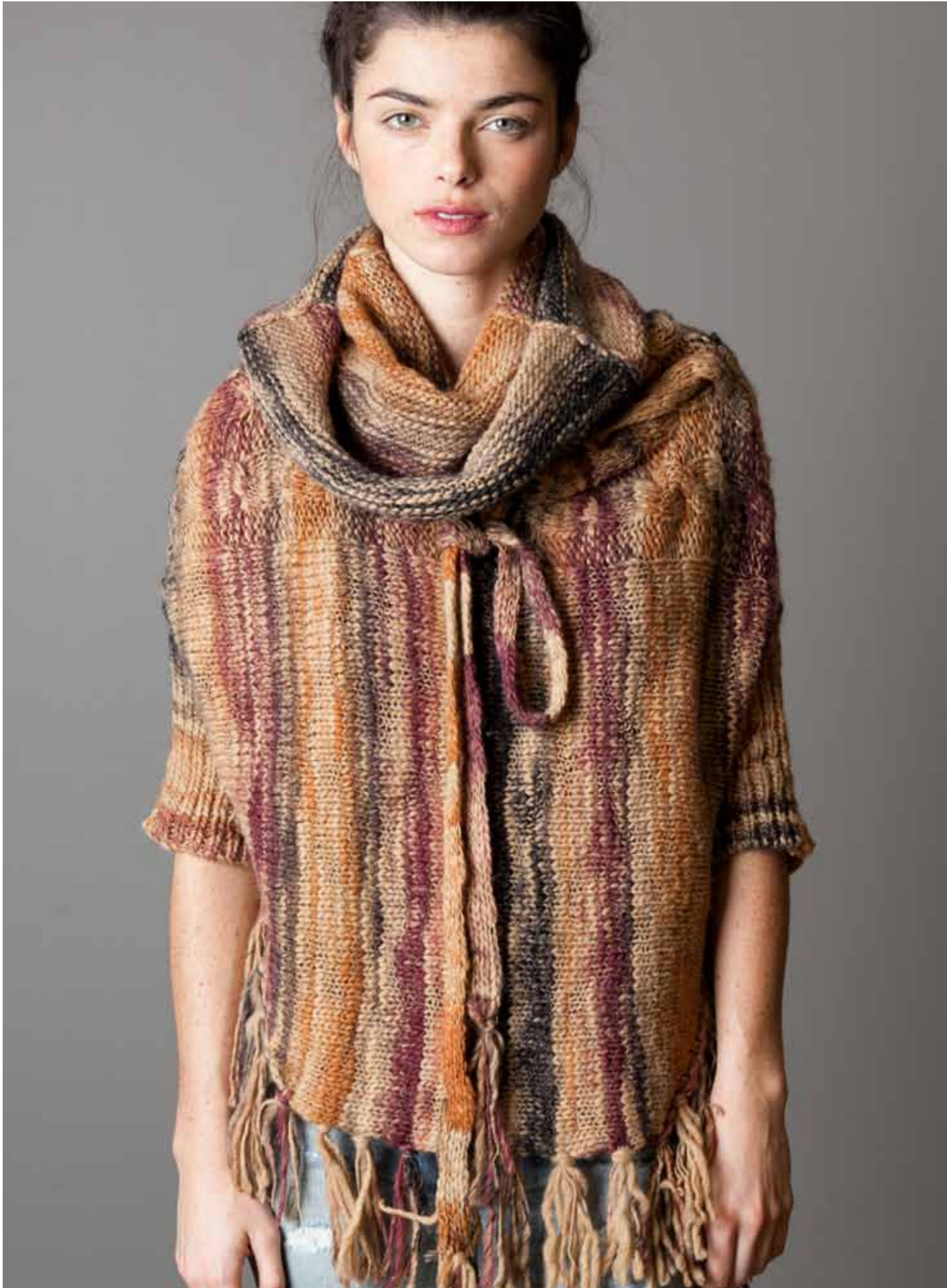
LANA SPACE DYE PONCHO SWEATER BURG/GOLD 2424