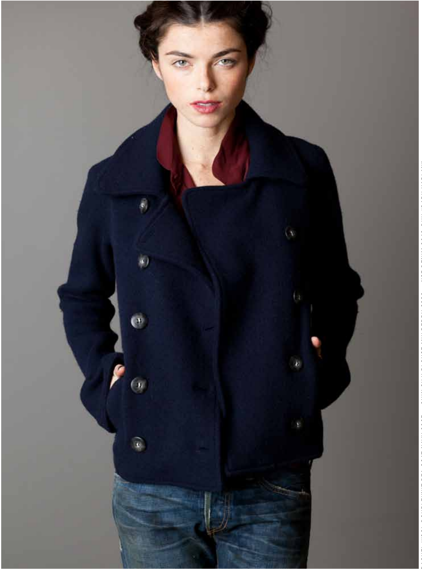
RACHEL WOOL DOUBLEKNIT PEA COAT NAVY 3067 + QUIN SILK BLOUSE MULBERRY 2383 + NSF DENIM 9043-DKH "DARK HARLAN"