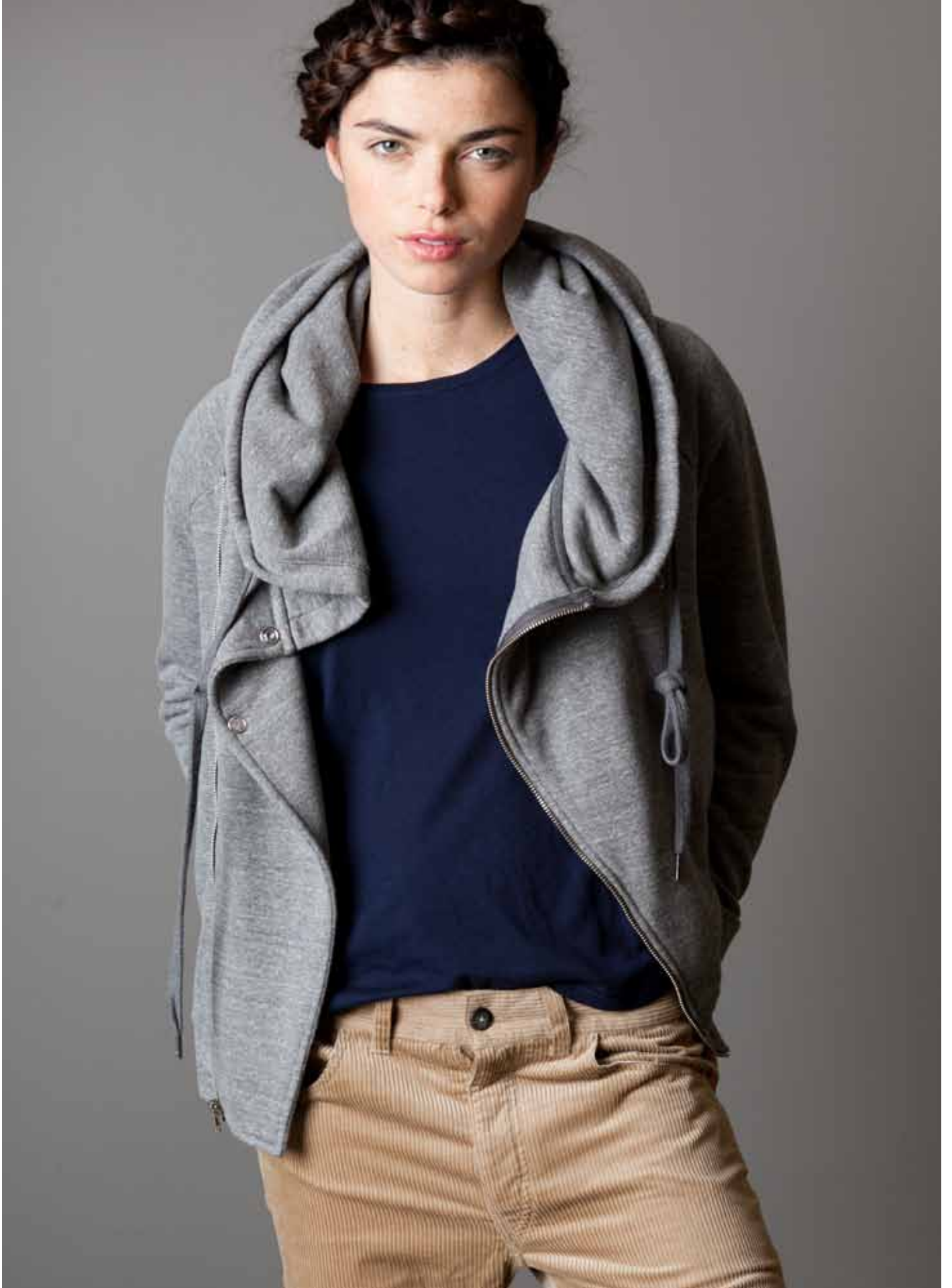
WALKER DRAPED HOODIE HEATHER GREY 2420HG + ADAMS TEE WHARF 2427 + RAE CORD 5 POCKET 9043-CORD CAMEL