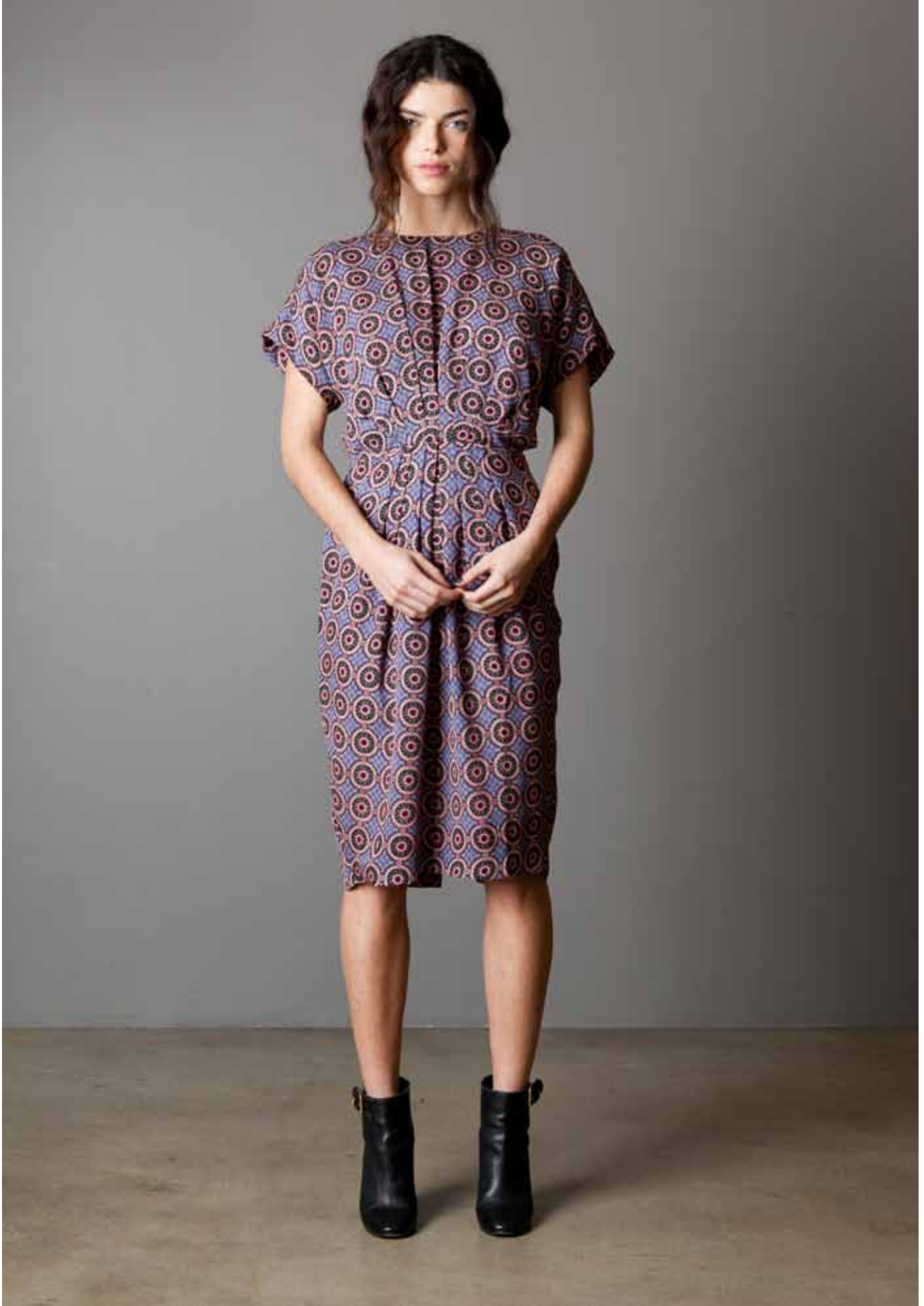
GABRIELLE SILK PLEATED TEE SHIRT DRESS IN TILE PRINT 1021