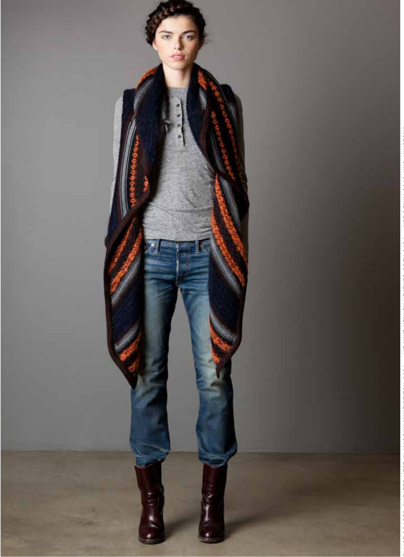
ELLIOT DRAPED SWEATER VEST IN MACCHU MULTISTITCH 2431 + LIZ KNIT HENLEY HEATHER GREY 2434 + NSF DENIM 9043-HUS "HUSTON"