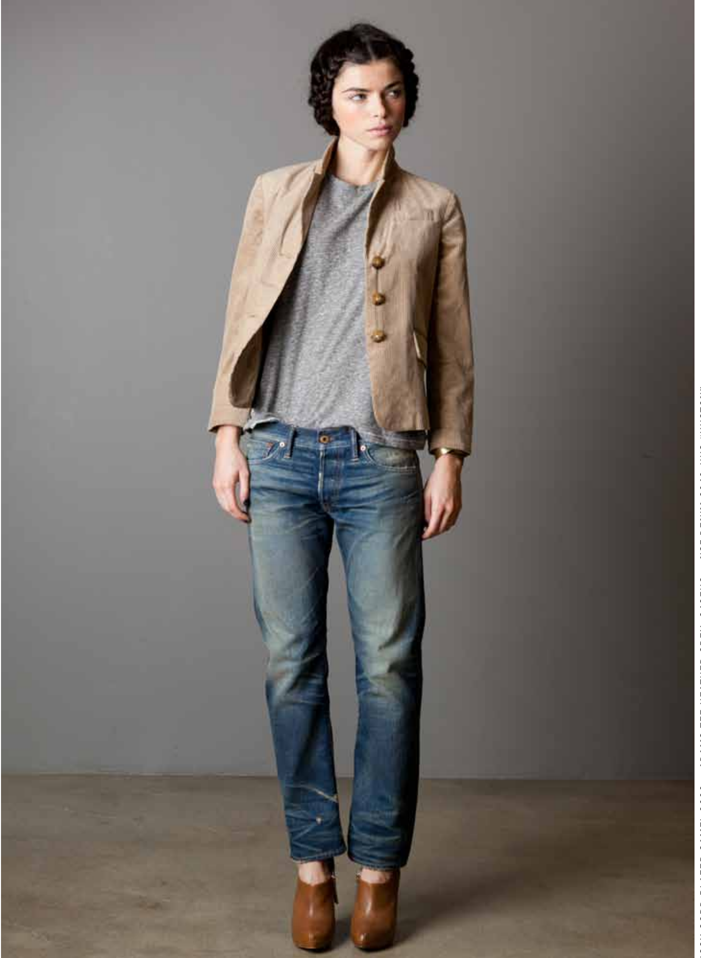
IGGY CORD BLAZER CAMEL 3066 + ADAMS TEE HEATHER GREY 2427HG + NSF DENIM 9043-HUS "HUSTON"