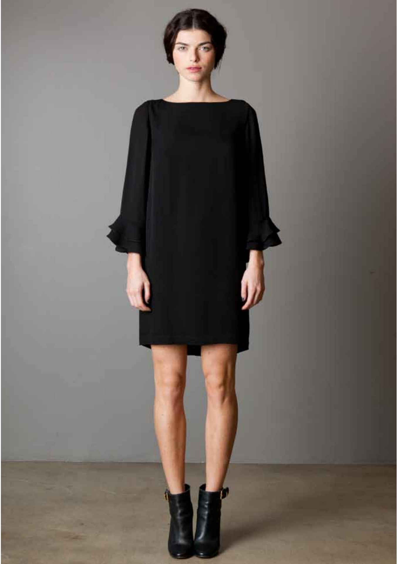
NINA RUFFLE SHIFT DRESS BLACK 1042