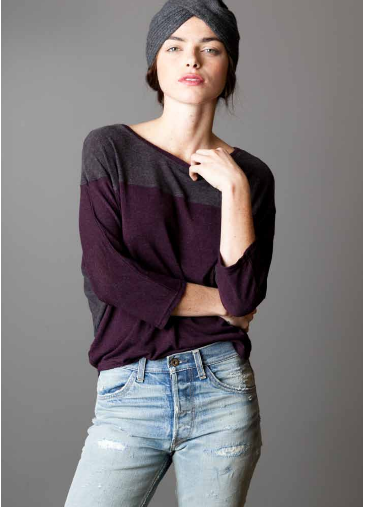
ECHO RUGBY TEE BURGANDY 2412 + NSF DENIM VINTAGE BELLBOTTOM 9046-CHE "CHELLE"