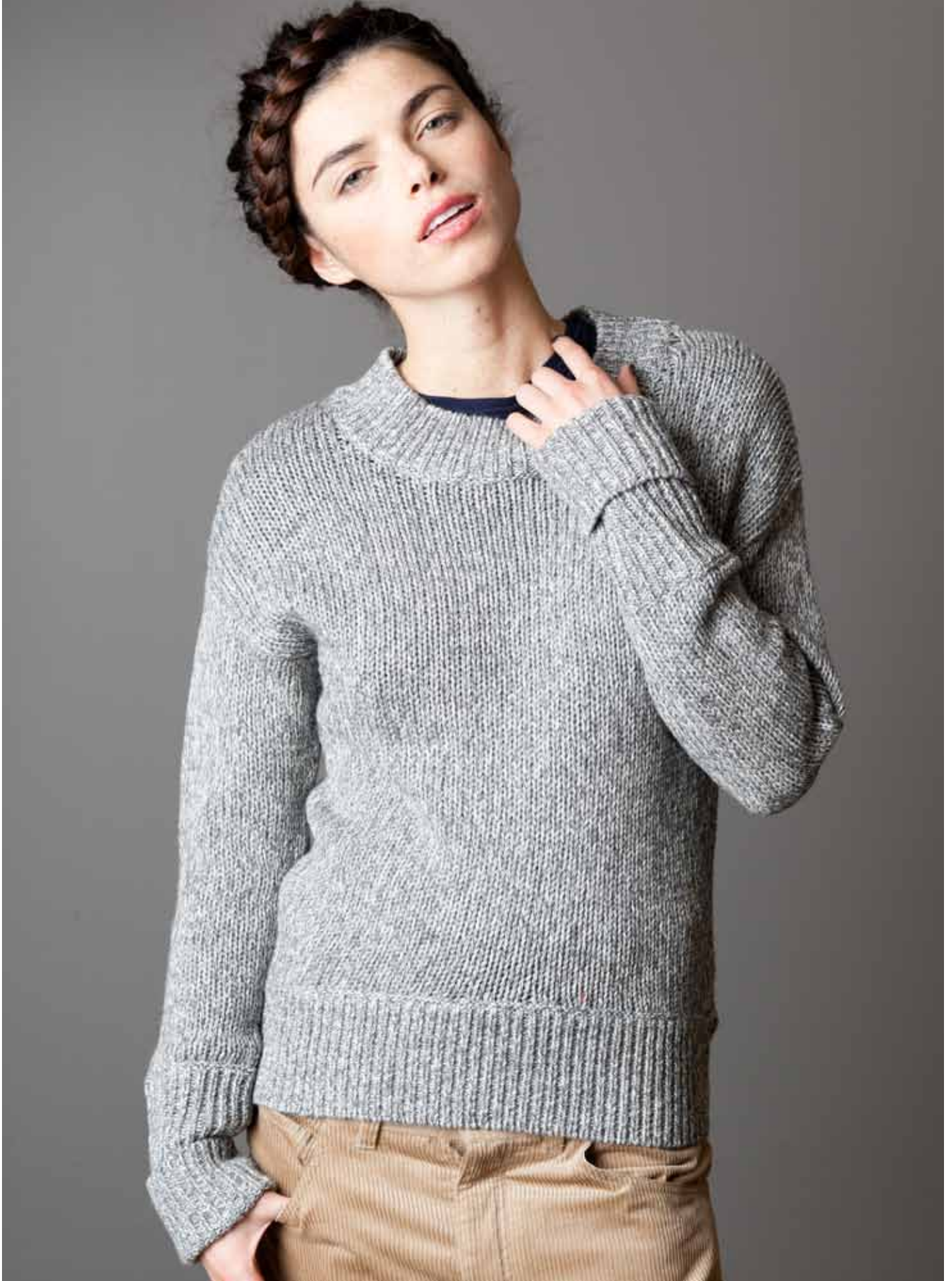
JACKSON PULLOVER SWEATER GREY MELANGE 2386 + RAE CORDUROY 5 POCKET CAMEL 9043-CORD